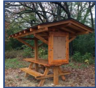
FBCW kiosk guides canoeists along the Badfish Creek.

Chapters of the RRC are groups of people working on local actions for local water resources. The Chapters are governed under the RRC by-laws and Board but are self-directed.