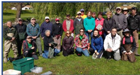
Volunteers at one of our stream monitoring trainings.