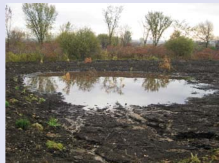
Check out the story on page 1 to learn how this newly installed rain garden is protecting water quality in the Rock River Basin. It is just one step a business took to become Green Tier certified.

For more information go to: http://www.cleanwaterbrightfuture.org