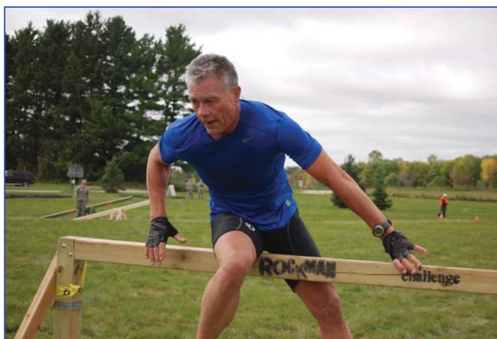
A full obstacle course greets the participants after the typical triathlon. Participants finish with a chicken dinner and knowing their physical challenge will result in positive physical changes to our environment.