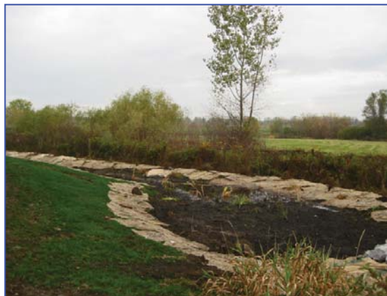
Newly installed rain gardens protect water quality and infiltrate water at Berres Brothers in Watertown. Berres Brothers supports a sustainable lifestyle by providing free coffee to anyone arriving at their store on a bicycle.