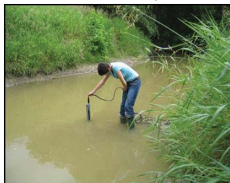
Determining the effectiveness of practices will take edge-of-field as well as in-stream monitoring as shown here.

Because this is the first regulatory adaptive management project in the Country and involves an estimated $59 million present-worth cost as