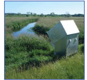
Water quality monitoring is a key component of both the pilot project and adaptive management as a whole.

Contrary to other approaches where limits are met at discharge locations, in watershed adaptive management, success is through proven water quality improvements. As part of the pilot project, four new USGS gaging stations are being installed to assess water quality improvements.