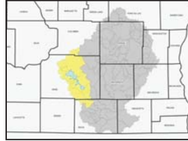
Yahara River watershed, part of the Rock River Basin

treatment improvements, this approach allows entities to pool resources to target practices that will lead to cost-effective water quality improvements.