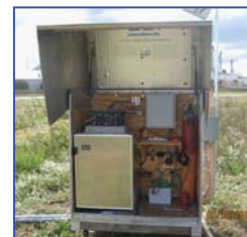
An inner look at one of the USGS gaging stations being used to monitor water quality at a field edge.