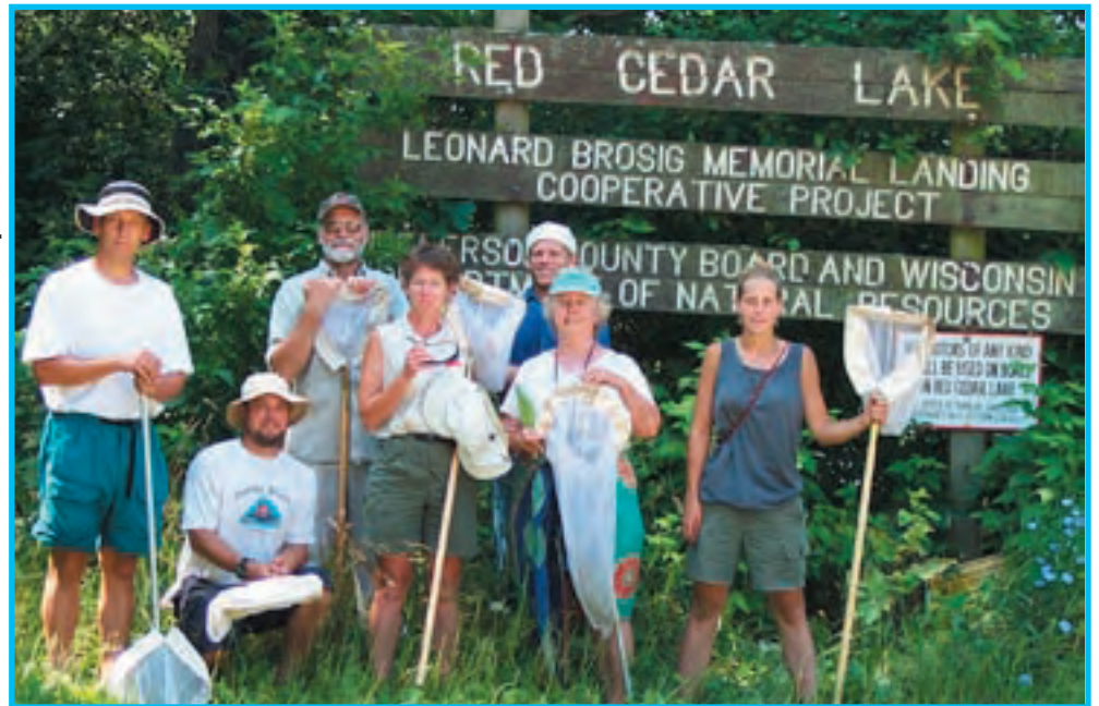
Several invertebrate monitors before sampling at Red Cedar Lake