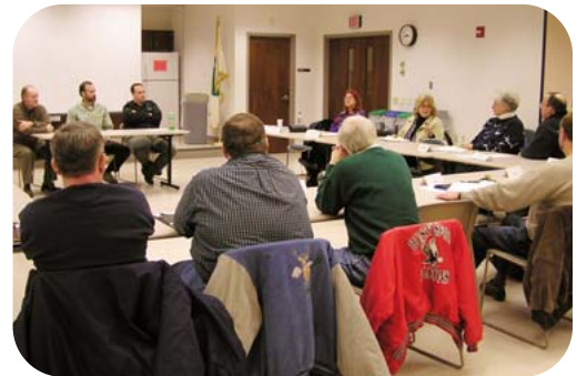
A Source Water Protection Planning meeting brought municipalities together to discuss drinking water protection.

After hosting a forum and completing interviews on new directions for the team, the group enlarged its scope to include promoting natural landscaping for rural non-agriculture landowners and more actively promoting the preservation of agriculture and open space in the basin. In June, Odyssey of Nature educational event for rural non-agriculture landowners was held. The 90 participants learned about prairie restoration, wildlife habitat and living closer to nature.