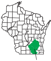
Rock River Basin