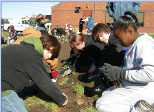
Beloit students learn-by-doing as they plant their rain garden in the shape of a turtle.

Stormwater is an important issue for the Rock River Coalition. We pledge to continue to support communities who desire to install rain gardens by providing suggestions on partnerships, letters of support for grants and assistance in planning educational events.